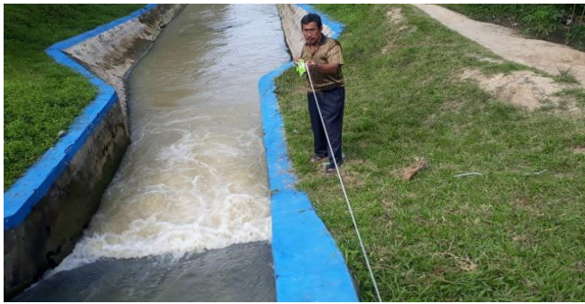
Fig. 3 Riset Field

From the results of field research in district irrigation seirampahserdangbedagai district in the can: (9)